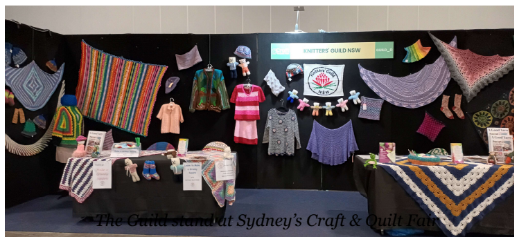
The Guild stand at Sydney's Craft & Quilt Fair