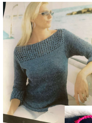
Knit A Sweater

If you'd be interested in any of these requests, please contact the Guild Secretary for all further details.