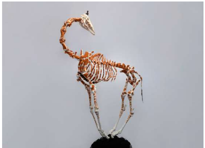
Sculpted and knitted - Michelle Beevors Giraffe

An exhibition 17-years in the making, from the towering giraffe stretching 4.4 metres in height, head raised to the windowed ceiling, to the army of 50 plus delicately rendered frogs, is astounding.