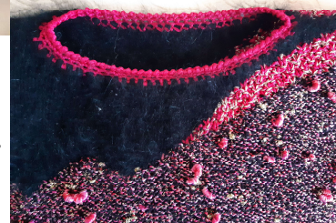
Modify A Sweater