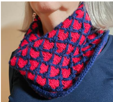
Knit - I'm sorry, I slipped (Fibrefest 2024)

This year's patterns for FibreFest have been released. Both are available free from Ravelry