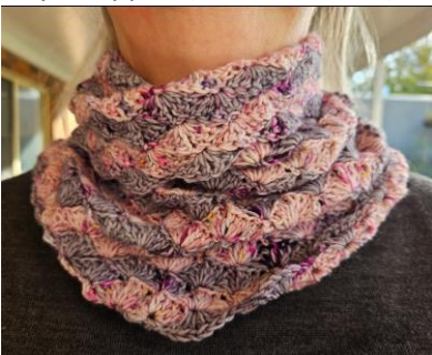
Crochet - Wave to Me (Fibrefest 2024)

Click on photos for links to Ravelry pages