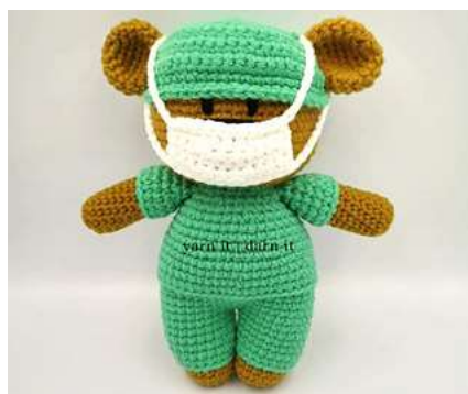
Photo published with kind permission of the designer, Aixan Legasto

https://www.ravelry.com/patterns/library/frontline-hero-bear