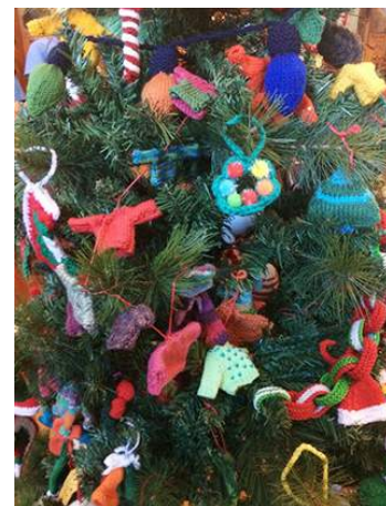
Christmas decorations from Newcastle