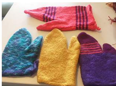
Pot mits from Ku-ring-gai

If you have an idea for a Guild event, we would love to hear from you. We're particularly interested in events that can be held in different parts of the state. If you have an idea, please contact me at president@knittersguildnsw.org.au