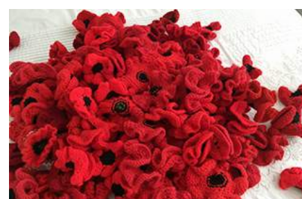
West Ryde are busy making poppies