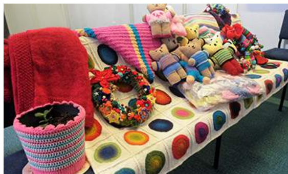
Left: Show and Tell ... Southern style