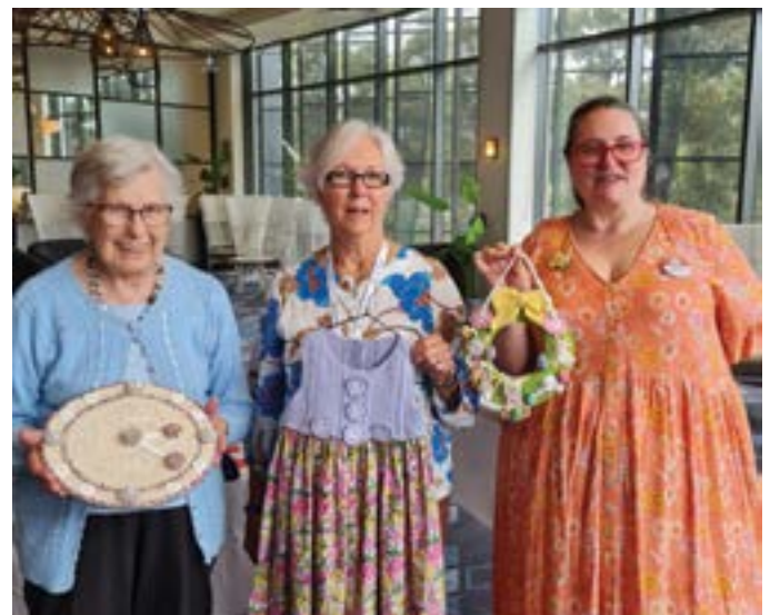
The winners of the seven-button challenge

The Knitters' Guild is a truly special organization. A big Happy 10th Birthday to Pittwater!