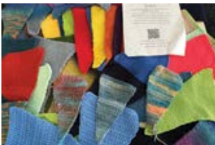
Blue Mountains - Bunting for the Glenbrook Village Festival

to produce over 50 triangles which, at the time of writing, we were looking forward to seeing proudly displayed in Glenbrook on 11 October.