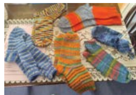
Southern highlands: Socks were fun to make and wear