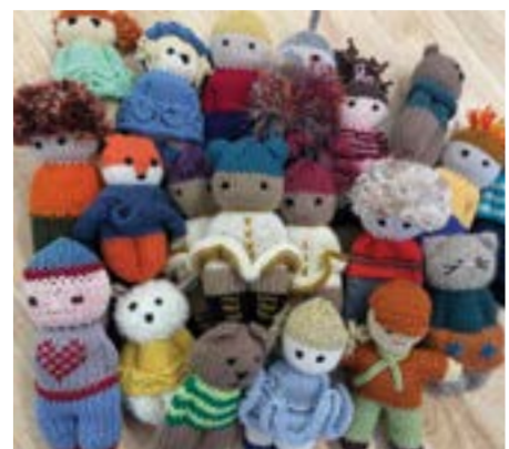
Inner city: the group made Izzy Dolls for the October meeting.