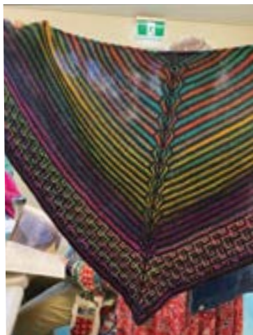
Turramurra: Di's mosaic crochet shawl