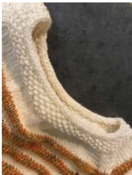
Northern Tablelands: I-cord knitting as taught by Robyn