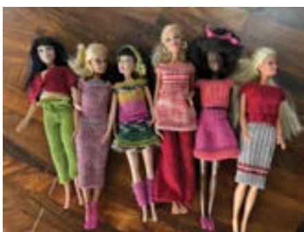
Newcastle: Some of the results of our challenge to knit or crochet with our scrap yarn