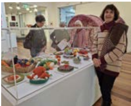
Inner West: A small group visited the Gut Feelings Project exhibition at Hazelhurst Gallery