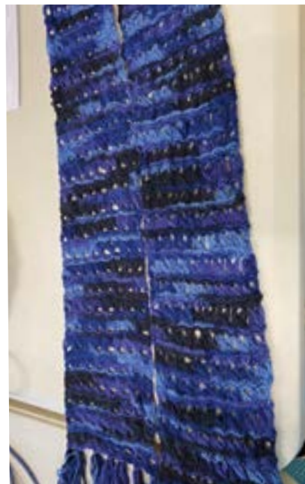
Turramurra: Pat H made a broomstick crochet scarf