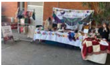
The Entrance: Our FibreFest stand helped showcase the Guild