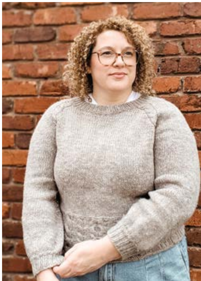
The Lydiard sweater