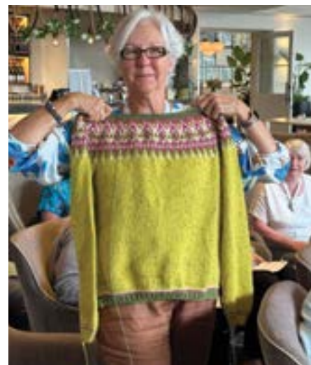
Pittwater: Two-stranded knitting was just one of the group's workshops