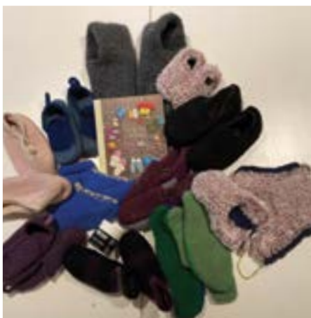
Inner West: The group discovered how many ways there are to make slippers