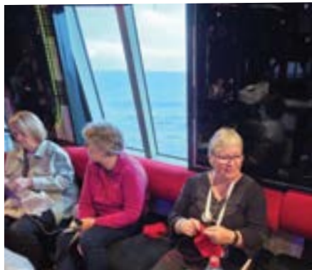
Wollongong: Members enjoyed the Guild cruise in August despite the rough seas.