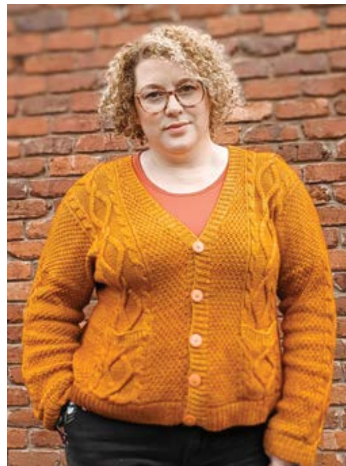
The Webster cardigan