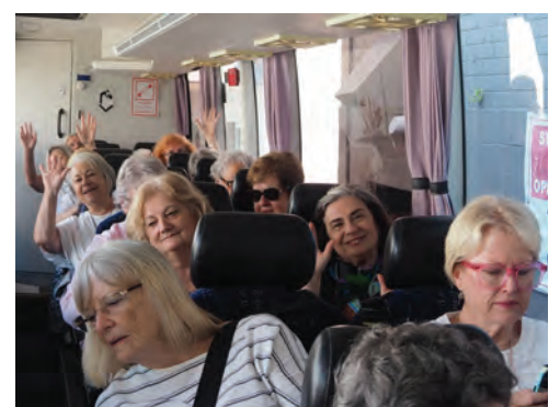
On the Bus!