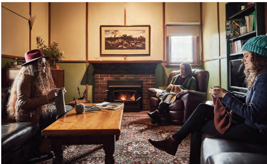
The Tarndie homestead offers accommodation for those keen to spend some time in wool country.

conservation: by supporting our yarn business, customers also support the repairs and preservation of the 1840s homestead and generate trade for local wool processors. The Homestead is a great place for crafters to gather too, so we host Crafty Sundays monthly for any woolcrafter to join in, plus a range of workshops and accommodation. Hopefully we can create an enthusiasm for conserving the Polwarth sheep, woolcraft skills, old farmhouses and in-person real life connections.