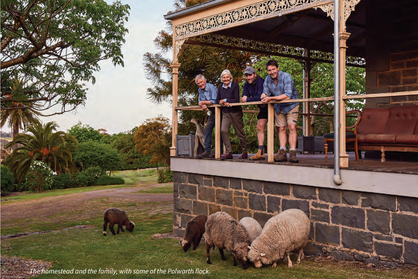
The homestead and the family, with some of the Polwarth flock.