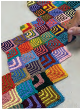
Turrumurra Crochet - Wendy's table runner made from wool remnants.

We love having visitors and are hoping to see you!