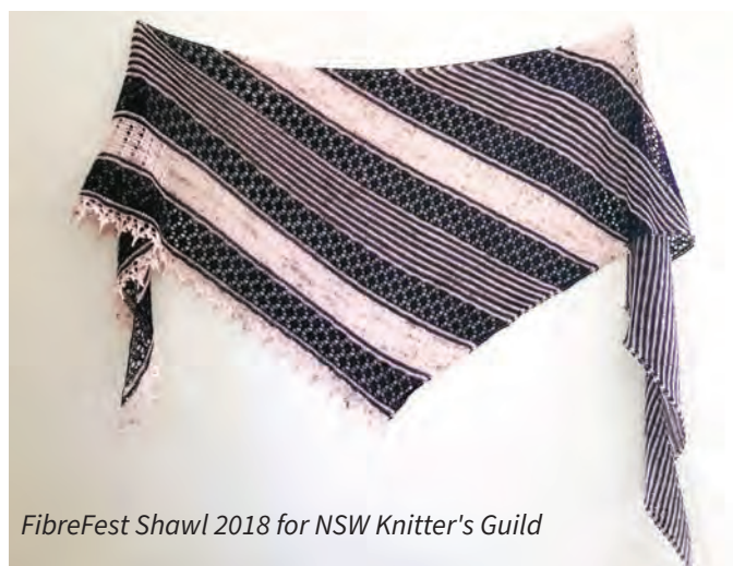
FibreFest Shawl 2018 for NSW Knitter's Guild