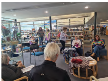
Mid North Coast - The Mid North Coast group celebrated Knit in Public Day at the library.