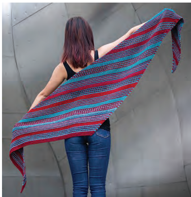
Snoqualmie for Nomadic Knits Magazine & Spincycle Yarns.