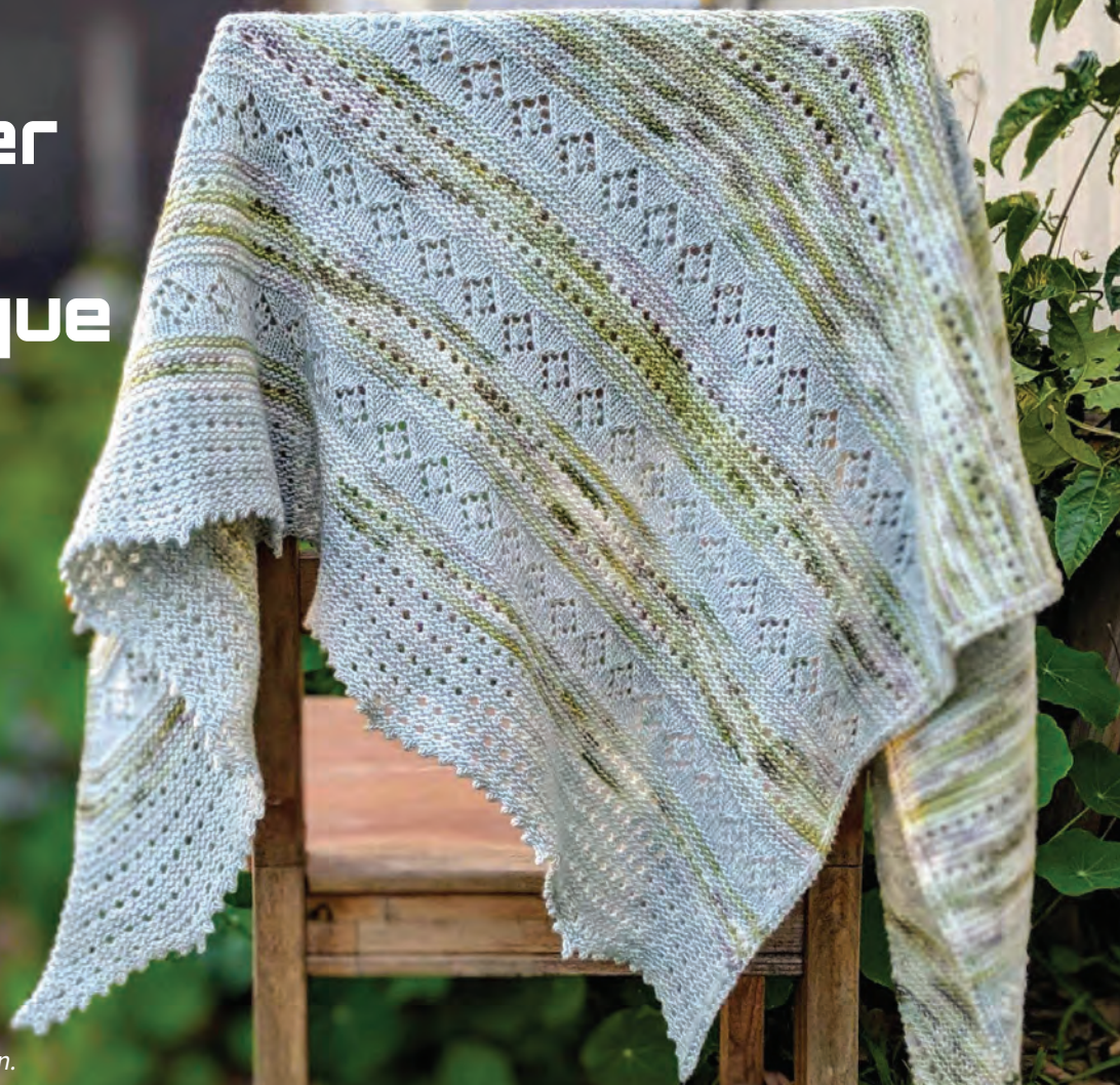
Frost for Great Southern Yarn.