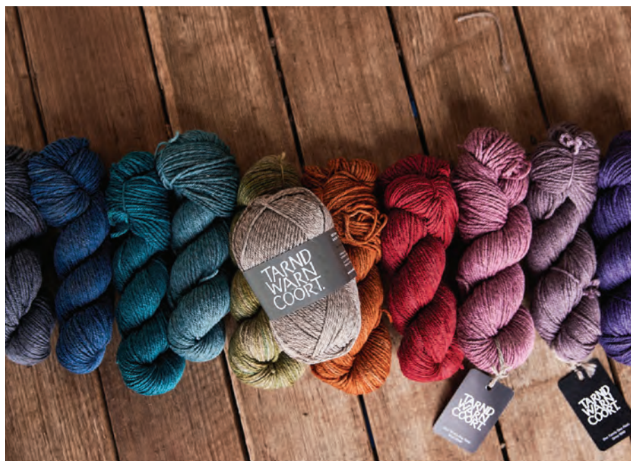
Some of the Tarndwarncoort range

We'll be hosting two to three teams in the International Back to Back Wool Challenge (an annual event that challenges teams of wool crafters from around the globe to create a jumper directly from a sheep's back to a human's back) on 21 March 2026. It's turning into a wonderful event with market stalls, demonstrations, a bar and food to accompany the jumper-making athletes! It would be a great reason to visit the Great Ocean Road region.