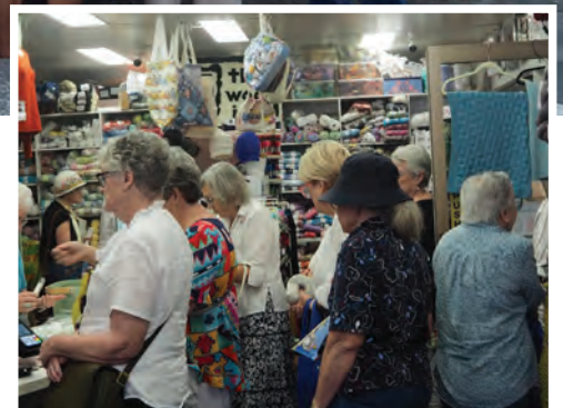
Getting That Yarn at The Wool Inn