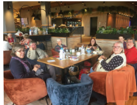
Goulburn Group - The Goulburn group enjoying World Wide Knit in Public Day at the Soldiers Club.

World Wide Knit in Public Day was fantastic! There were 14 members and 7 visitors distributed throughout a warm area in the Soldier's Club, huddled up near the fire. Everyone was continuing their knitting and crochet projects while constantly being distracted with delightful conversations and the tantalising aroma of the nearby cafe. Overall, a very successful day, as it is every year!