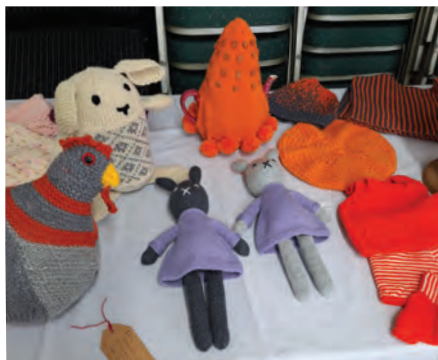
Epping Group - The Biggest Morning Tea items in grey and orange to show support for brain and leukemia cancer.