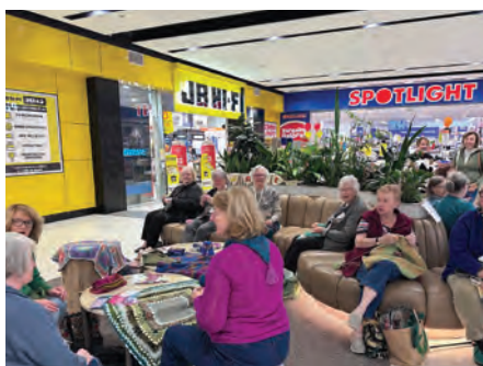
Pittwater - The Pittwater group celebrated World Wide Knit in Public Day at Belrose Super Centre store.

could crochet or knit in around half an hour. These included such things as bottle holders, bookmarks, cup warmers, headbands and cushion decorations.