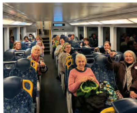
Epping Group - The Epping group enjoying Knit in Public Day on the train trip to Wyong.