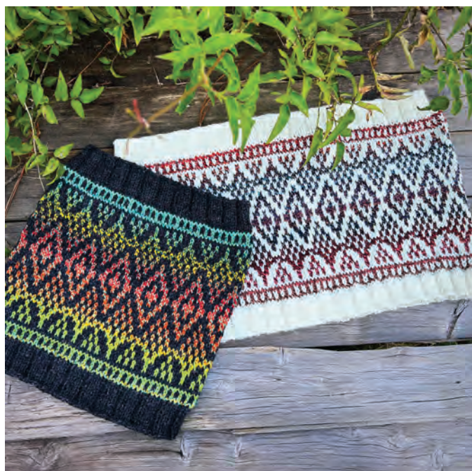
Diamondback Cowl for Spincycle Yarns.