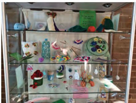
Pittwater - The group's library cabinet focused on 30 minute crafts.