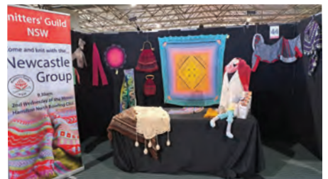
Newcastle - The Group took part in the Craft Alive, Newcastle event.