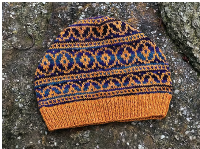
Gatsby for Cat & Sparrow AU