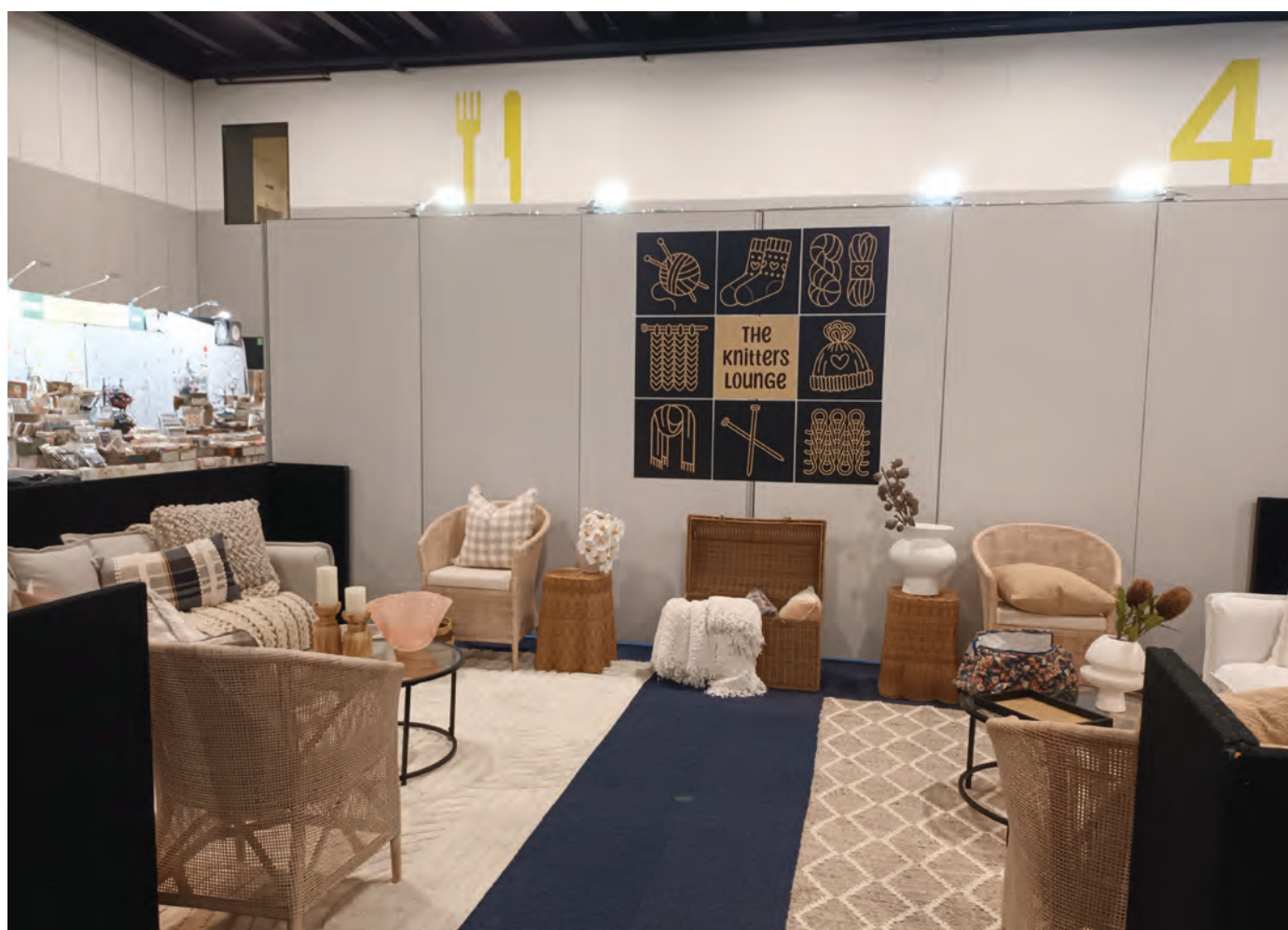
The Knitters Lounge, where curious crafters could learn to crochet