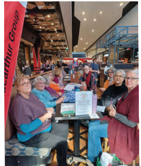
Macarthur Group - World Wide Knit in Public Day at Jamaica Blue Cafe in Narellan.