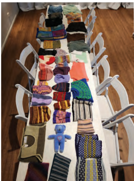
Inner West - Donations for the Benevolent Society.

At our June meeting we put the finishing touches to our items for charity.