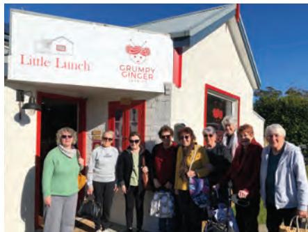
Maitland - The Maitland Group made an outing to the Grumpy Ginger yarn store.