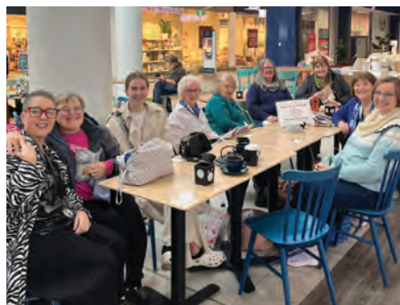
The Entrance - The Entrance group celebrating Knit in Public day.