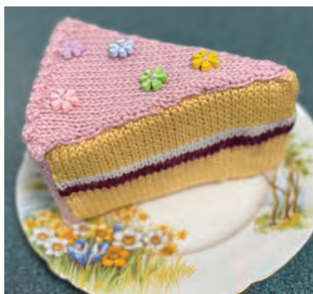
Southern - The Southern Group raised more than $700 for the Biggest Morning Tea.