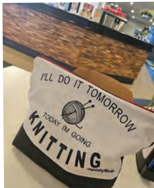
Wollongong - The group celebrated Knit in Public day at Collegians Balgownie.